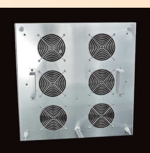
Medium wave heating equipment, models FIRM