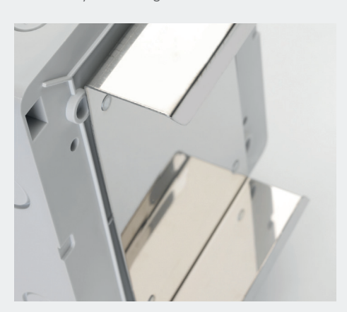
Robust backing on the electronic controller allows you to fit in a secure location so no damage can be caused.