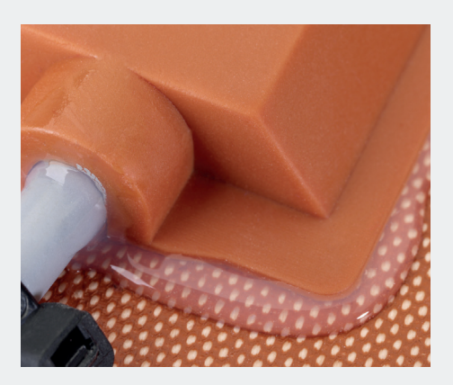
Reinforced mould termination to protect electrical connection.