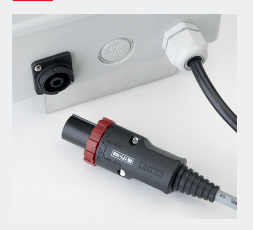
Connectors for the HIBC/A come as standard with safety lock fitting.