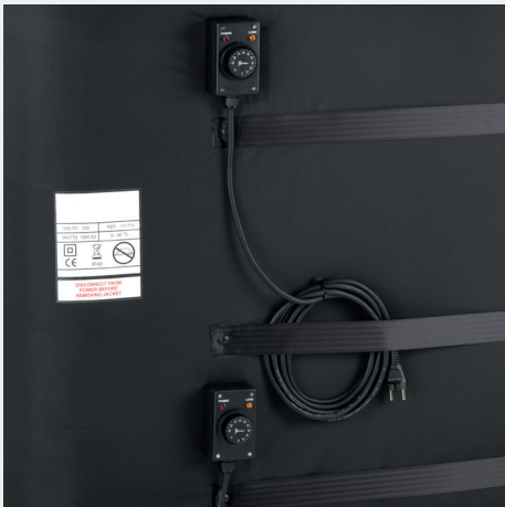
Bespoke printing for the HIBC/B is available, detailing your company information and specifications for the element.